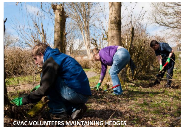
CVAC VOLUNTEERS MAINTAINING HEDGES

Cumbernauld Village Action for the Community (CVAC) has taken collective responsibility for the Langriggs. With the support of the Council they have set up allotments, created an orchard, re-laid hedges and planted 100s of bulbs. CVAC now has an environmental volunteering group who help with the future development and maintenance of the Langriggs. Working together NLC and CVAC have successfully reclaimed this once unloved and historic greenspace for the community.