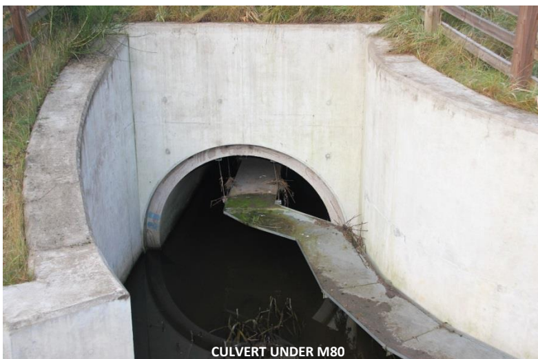
CULVERT UNDER M80

The 2013 City Health International conference was held in Glasgow and the Living Landscapes took the opportunity to exhibit and showcase the role greenspace plays in health and wellbeing. As well as promoting our work we asked conference delegates to help us create 400 wildflower seed bombs with kits on loan from Glasgow company Kabloom. These balls of wildflower seed, compost and shredded paper were a hit and the delegates bombarded an area of waste ground next to the Glasgow Science Centre. We are now working with Kabloom to develop a package that we can use at events in the coming year.