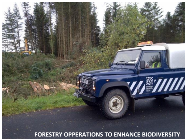
FORESTRY OPERATIONS TO ENHANCE BIODIVERSITY

ENHANCING BIODIVERSITY IN URBAN GREENSPACES – The Scottish Wildlife Trust has undertaken a major project to enhance the much loved Forest Wood Wildlife Reserve. Funding from landfill tax credits through the Biffa Award has enabled the Trust to restructure the woodland to allow natural regeneration and peat bog restoration. The project is creating new wildlife habitats by planting hedgerows, digging ponds and sowing wildflower meadows.