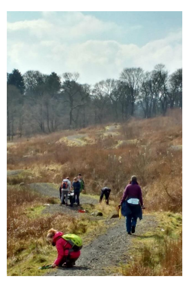
Photos (clockwise from top left): Clearing paths has improved access; artworks have provided interpretation; Living Windows have form and function; surveys at Ravenswood have improved our understanding of the site; tree planting is reinforcing native woodland regeneration. (Over page) existing meadows are being reinforced;