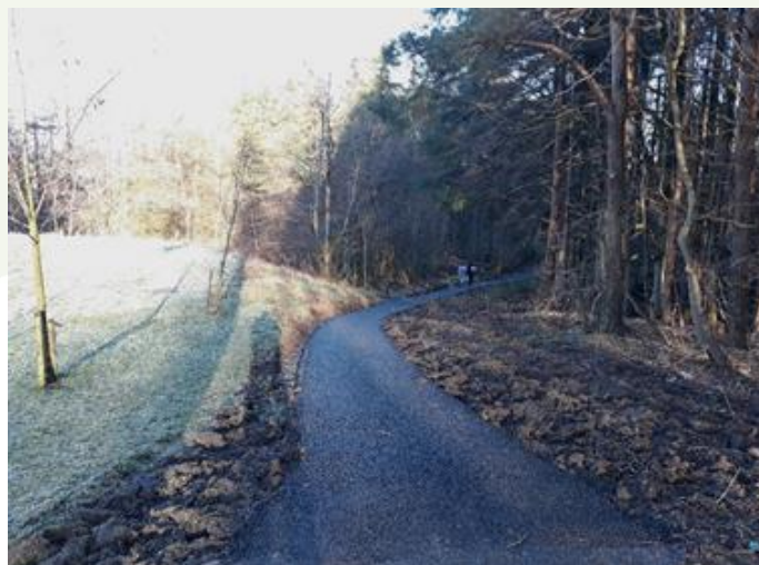
After the new path was laid at Seafar