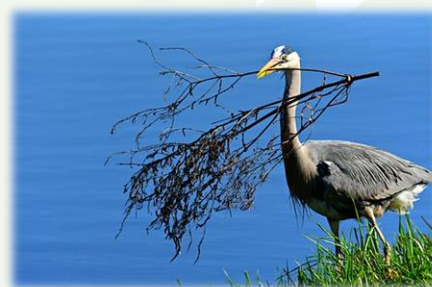
Heron collecting nest material

Presenting your intended with gift of food and bedding material shows them that you can provide