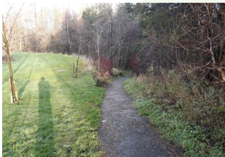
Before the new path was laid at Seafar

This work was funded by the National Lottery Heritage Fund and Campsies Centre (Cumbernauld) Ltd. Tell us what you think of the finished path @wildCumbernauld and https://www.facebook.com/CumbernauldLivingLandscape/